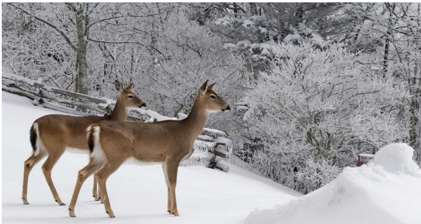
Grandfather Mountain, milepost 305.