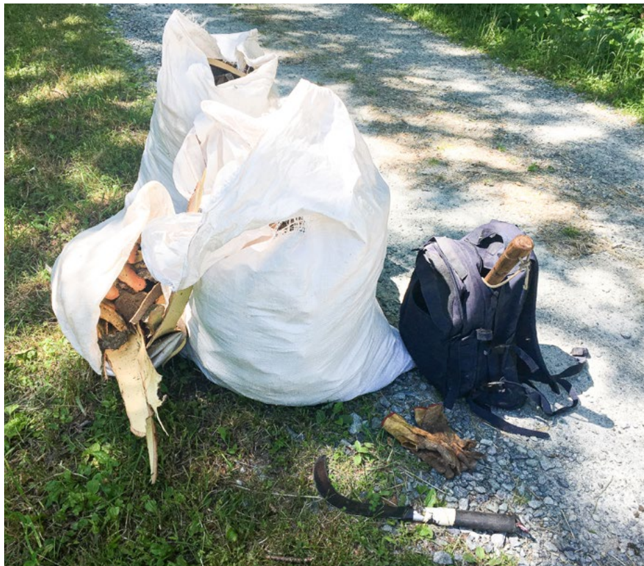
Trash bags of bark stripped from witch hazel plants, along with poaching tools, seized by Law Enforcement Rangers.

Chief Ranger Neal Labrie reports that his team is able to cover more ground and get a jump on emerging poaching efforts thanks to the devices. For instance, they were able to catch and charge a poacher for stripping bark from a stand of witch hazel plants, an attack on natural resources they had not seen before. Though the trees are not a threatened species, rangers are gaining awareness of what could be an emerging threat to the natural resources they protect.