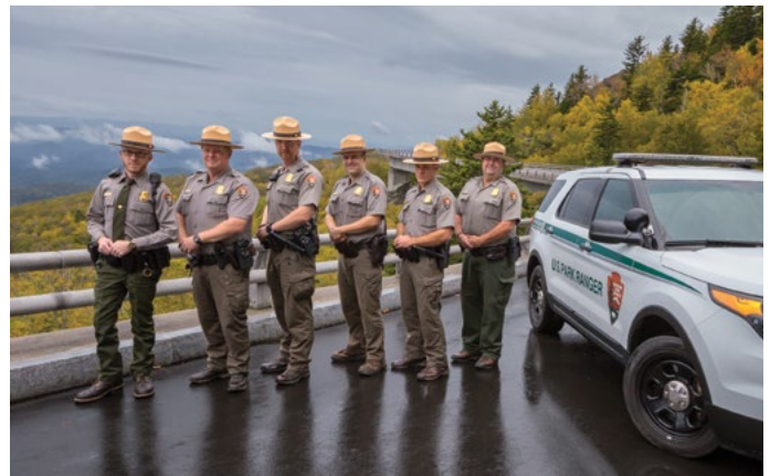
Park Rangers can now rely on a new dispatch system.

The system is enabling the dispatch team to increase its focus and efficiency by more than 50 percent, allowing each member to provide better