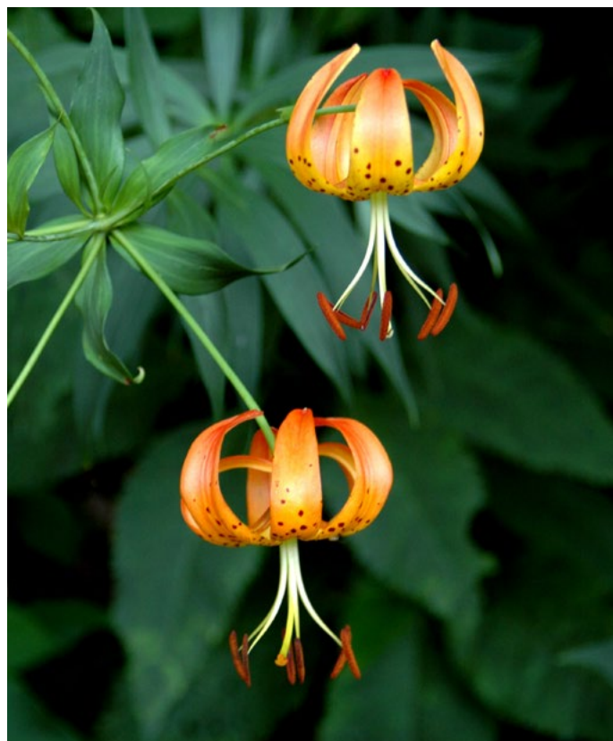
Turk's Cap Lily.

Gifts of stock or other appreciated assets are an effective way to support the Parkway. If you own stocks, securities, or other property that has appreciated since acquisition, you may face capital gains taxes if you sell. Donating that asset to the Foundation avoids the tax, and you can receive a charitable deduction for the entire market value of your gift.