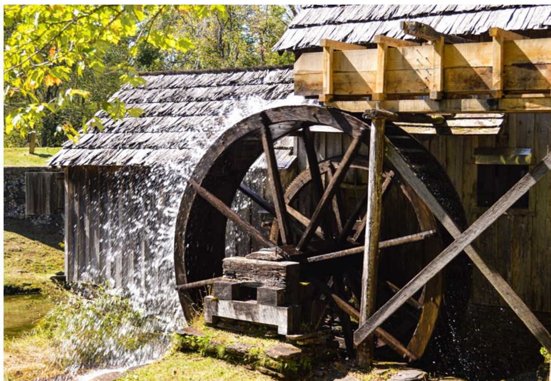
Mabry Mill, milepost 176