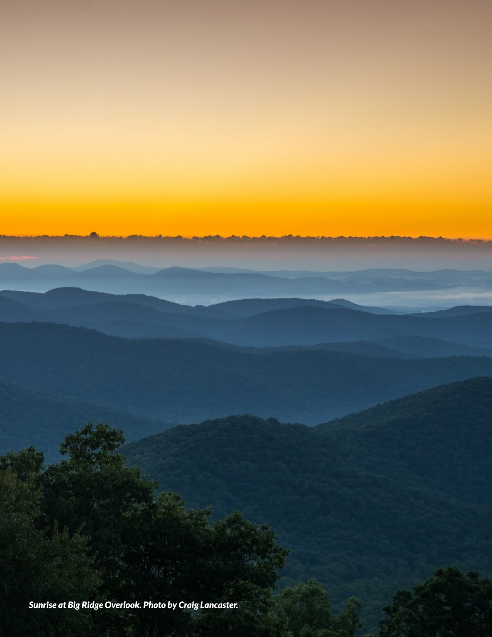
Sunrise at Big Ridge Overlook.