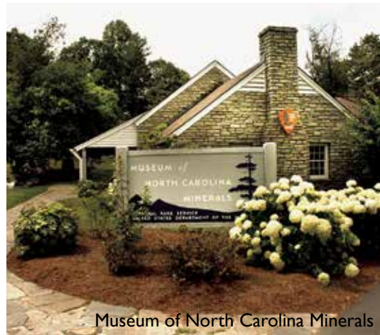
Museum of North Carolina Minerals