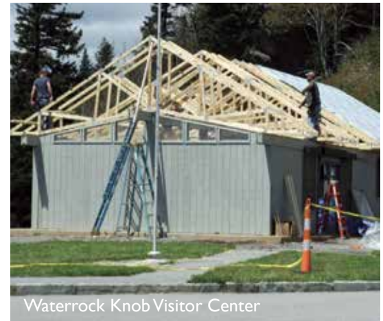
Waterrock Knob Visitor Center