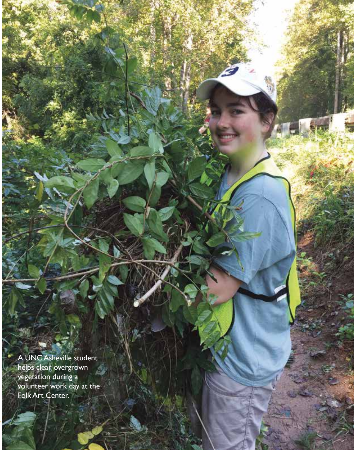
A UNC Asheville student helps clear overgrown vegetation during a volunteer work day at the Folk Art Center.

To become part of the Volunteer Corps, visit brpfoundation.org/volunteer .