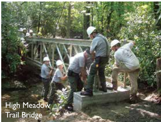
High Meadow Trail Bridge

In 2014, flooding washed out the footbridge over Chestnut Creek, making for a soggy trek along the High Meadow and Fisher Peak Loop trails at the Blue Ridge Music Center. Now a new steel and wood span makes for a safe and dry crossing for families and other Parkway visitors enjoying the Kids in Parks TRACK Trail.