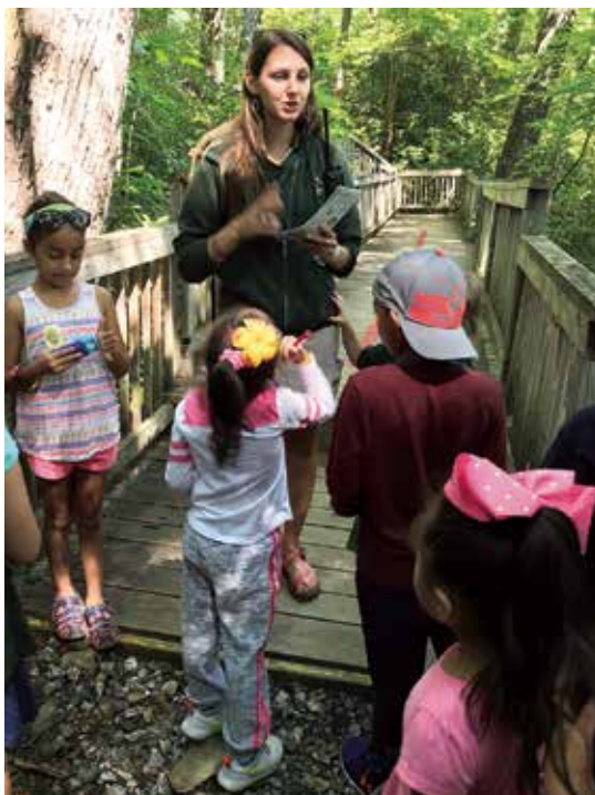
Children embark on a guided TRACK Trail hike at Chimney Rock State Park.

This year, KIP added more TRACK Trails in National Parks and expanded along the Parkway corridor. It was a record-breaking year for hike registrations with more than 4,000 TRACK Trail sign-ups. Those registrations equate to more than 130,000 children who have trekked TRACK Trails, including 10,000 who visited Parkway locations. Because of these sustained results,