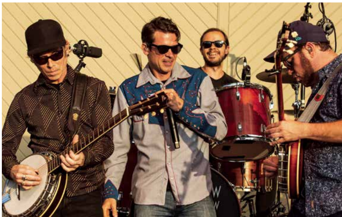
Old Crow Medicine Show wows a sold-out crowd at the Blue Ridge Music Center in August.