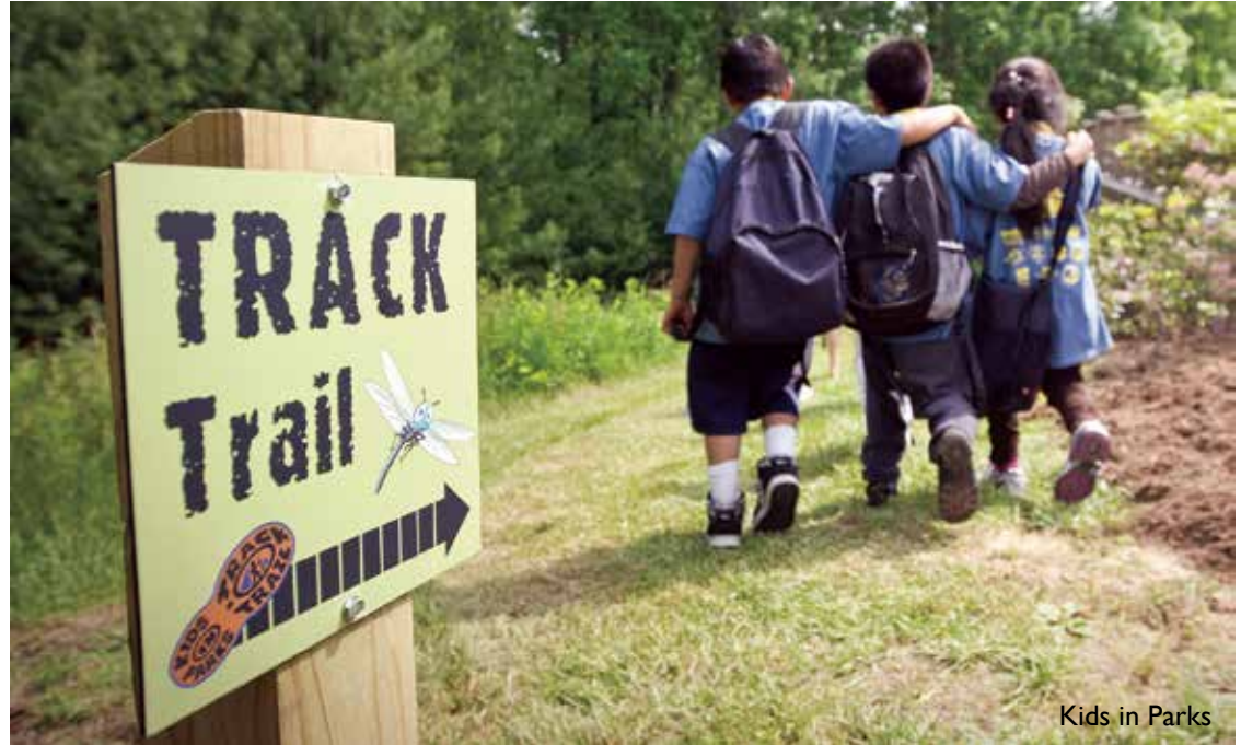
Kids in Parks

Over the years, the Parks as Classrooms program introduced thousands of children to the wonders of the Parkway. Rangers brought a wealth of knowledge about wildlife, mountain habitats, and more to schools in neighboring communities.