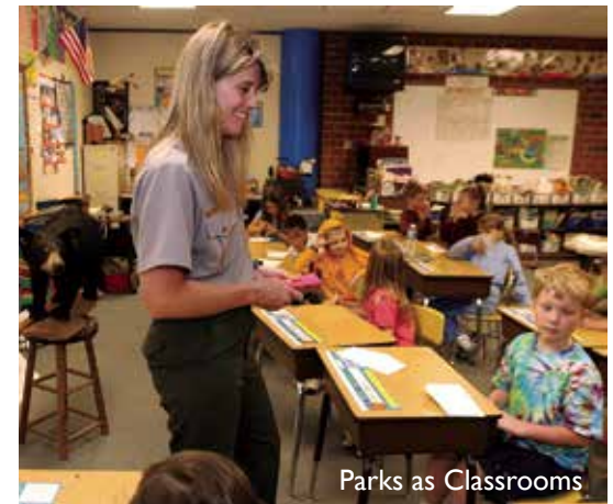
Parks as Classrooms