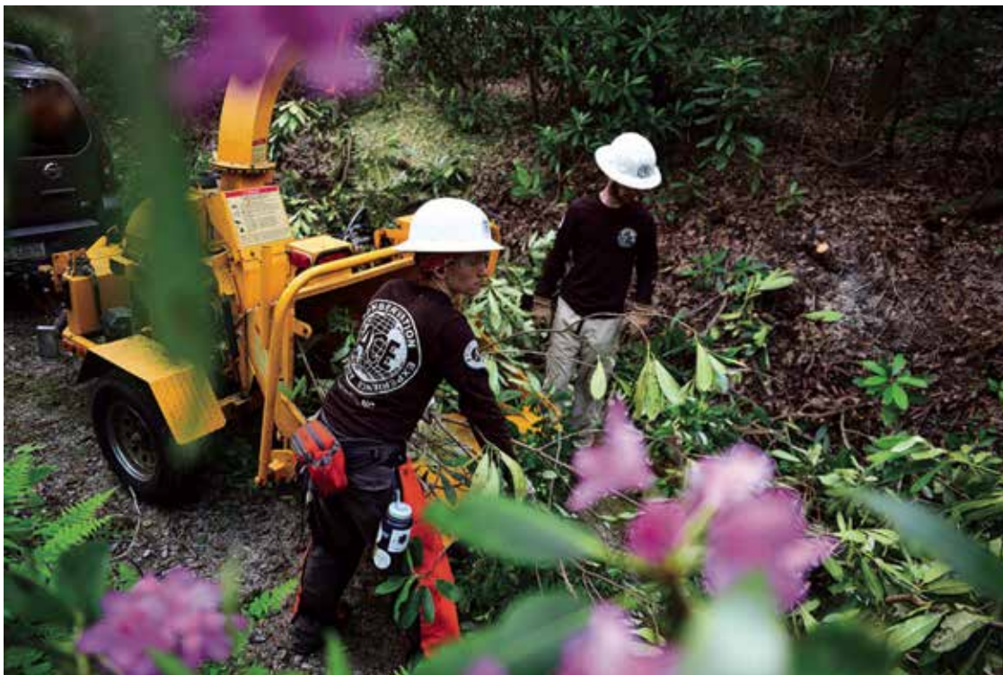
Moses H. Cone Memorial Park was a hub of activity this year with an American Conservation Experience crew clearing carriage trails and workers replacing the roof at Flat Top Manor (below).