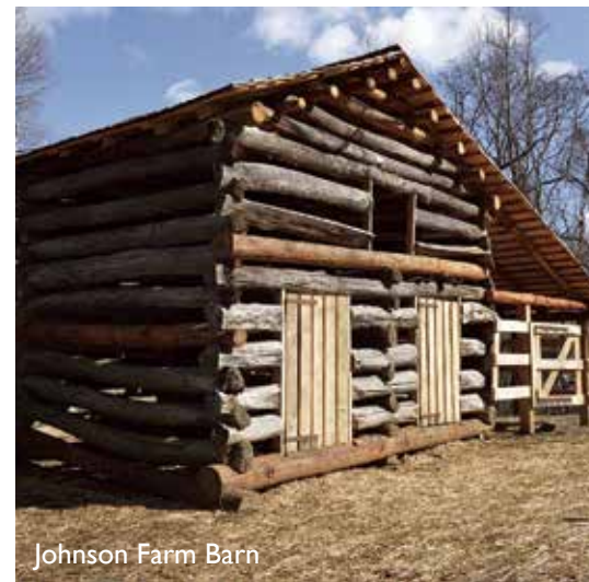
Johnson Farm Barn