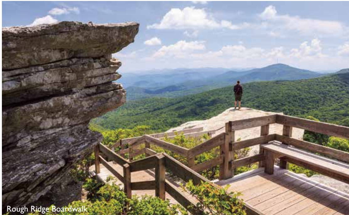
Rough Ridge Boardwalk

Your gifts funded the repaving of Abbott Lake Trail at Peaks of Otter, milepost 86, in late 2015, making it accessible for those with mobility disabilities. The one-mile loop wraps around the lake, offering views of Sharp Top and Flat Top mountains and Harkening Hill.