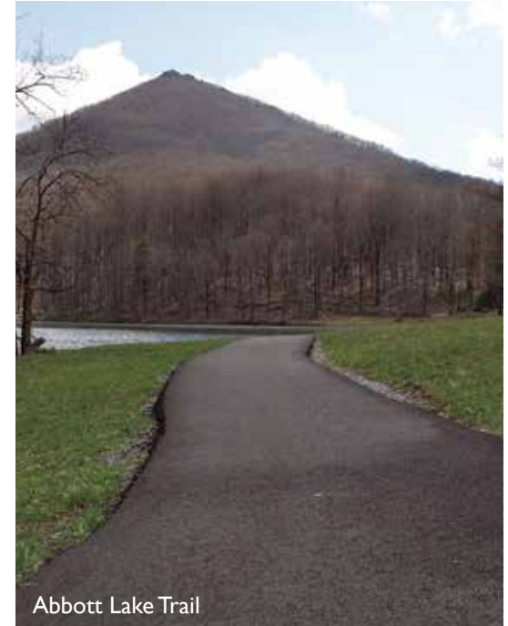
Abbott Lake Trail