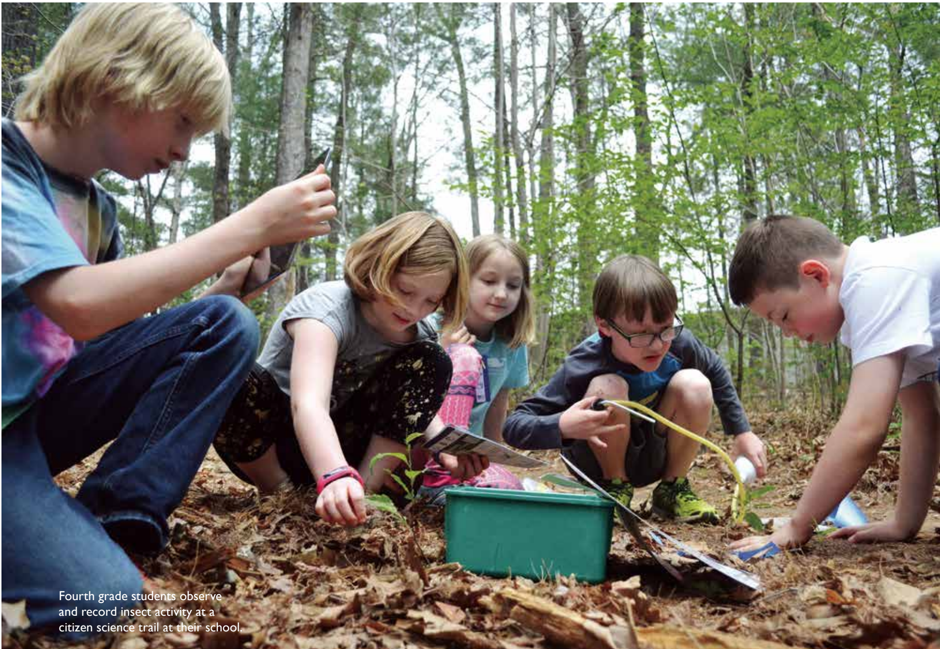
Fourth grade students observe and record insect activity at a citizen science trail at their school.