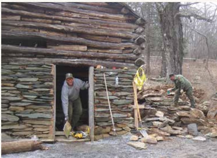
National Park Service employees recently began repairing stacked stone on the farm buildings at Humpback Rocks.