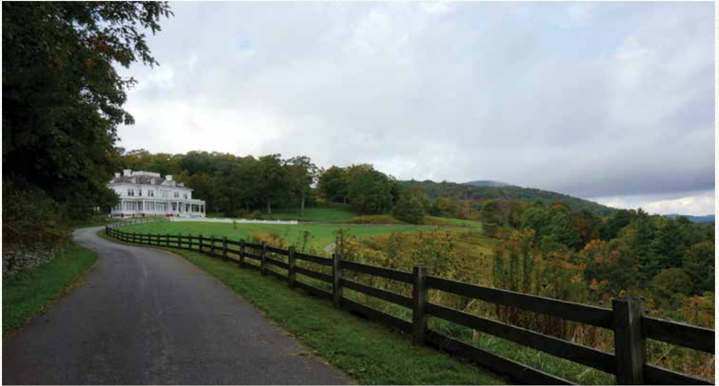
Designed by Greensboro architect Orlo Epps in the colonial revival style, Flat Top Manor was completed in 1901.