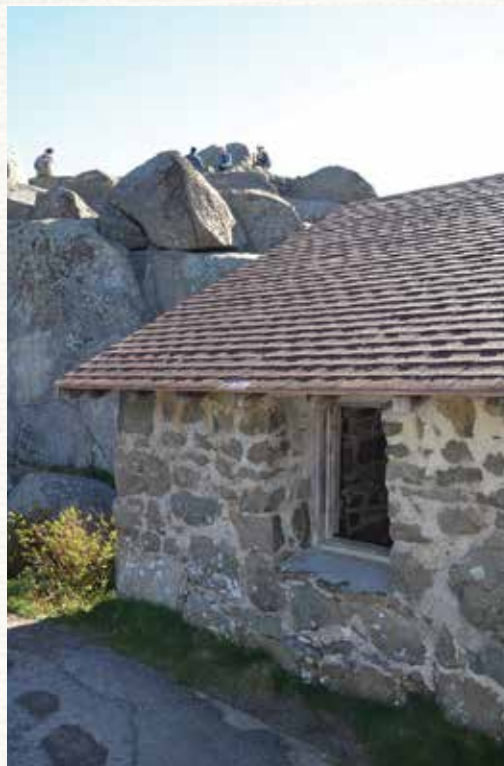
The shelter at Sharp Top Mountain was built in 1858 by the Otter Peaks Hotel.

Work is set to begin this spring to rejuvenate the little stone shelter that greets visitors at the summit of Sharp Top Mountain at the Peaks of Otter. National Park Service staff will scrub away extensive graffiti, repair and reset windows, doors, sills and thresholds, replace the roof, and stain the clapboard siding to prepare the building for future interpretive programs and secure it against the elements. Donations for this project will be matched through the Centennial Challenge program!