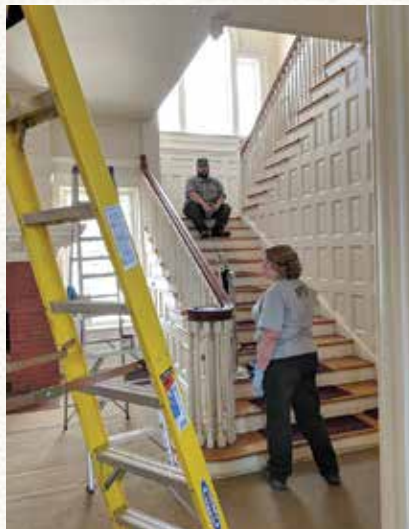
Spring cleaning at the manor