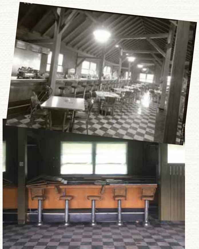
Shown in its early days and today, Bluffs Coffee Shop was built in 1949 and operated for more than 60 years.

We are so close to bringing this beloved place back to life. Let's reopen the doors to new memories at Bluffs.