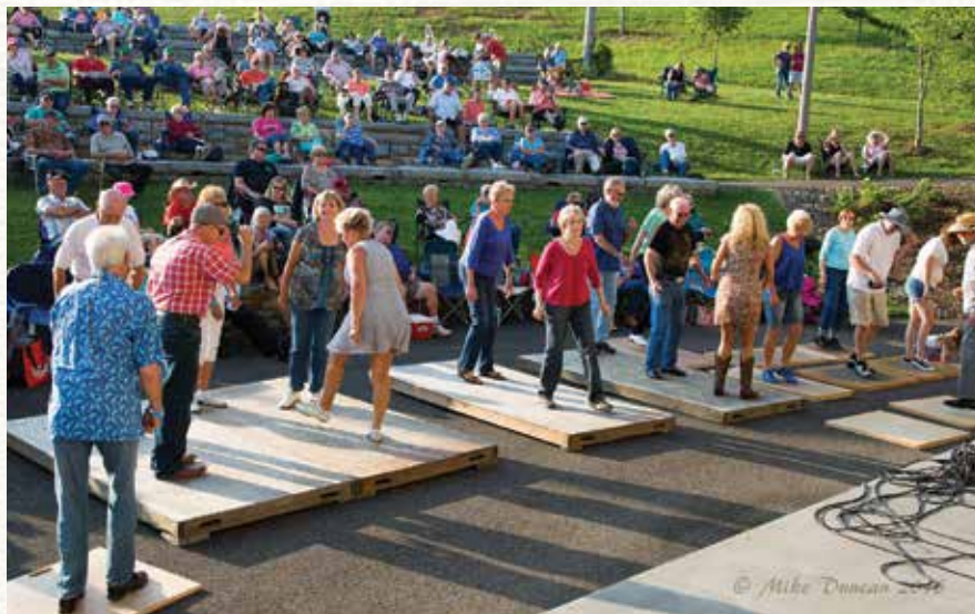
Concertgoers step to the music of the Mountain Park Old Time Band at the Music Center near Galax, Virginia. Flat-foot dance lessons were just one of many programs offered at the venue last year.

The Blue Ridge Music Center is gearing up for a fantastic season of concerts (see schedule on page 11), and you can take center stage in making the Roots of American Music series a success. Your gift brings people together to experience old-time, bluegrass, folk, Americana, country blues, and gospel performances and learn about how these forms of music took root and grew into an American sound. Let's keep this rich tradition of homegrown music alive in the mountains.