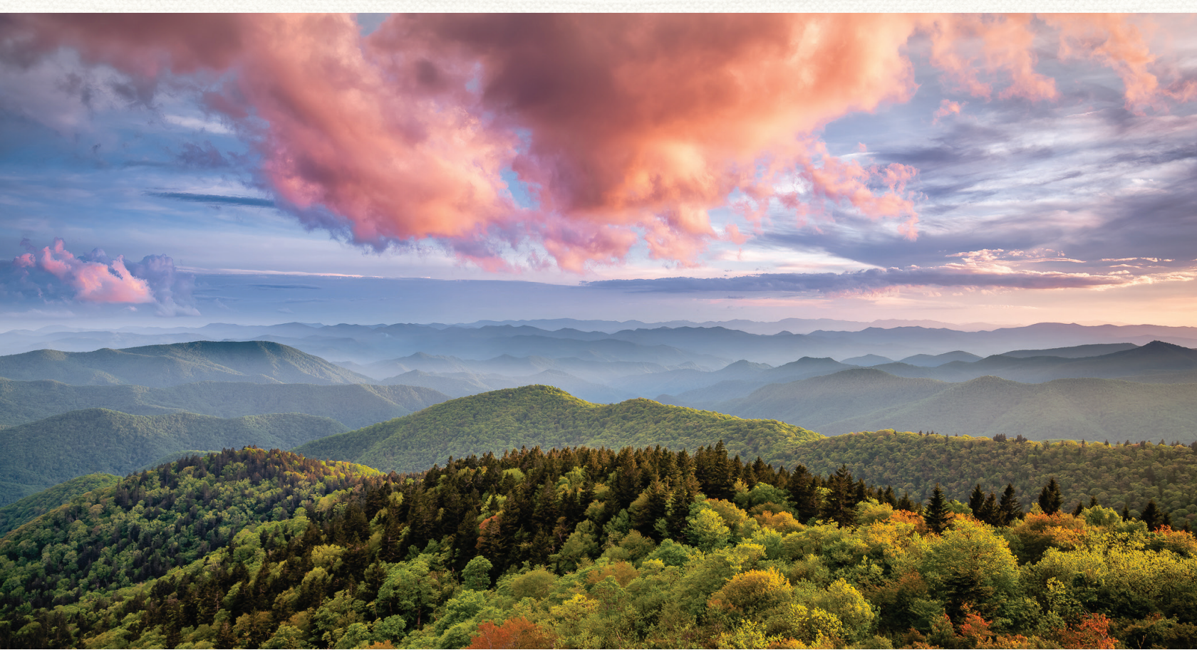
"The Color of Summer" by Rhonda Kingen, a finalist in the 19th Annual Appalachian Mountain Photography Competition

Blue Ridge Parkway Foundation - Summer 2022