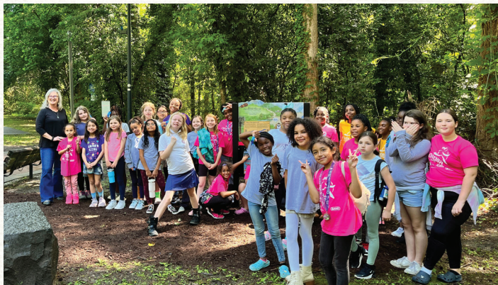
Grand opening at Cayce Riverwalk in Cayce, S.C.

and two disc golf courses in six states. More than 30 additional trails are slated to join the network soon. The most recent additions include Cherry Blossom Trail in Virginia, Cypress Gardens in South Carolina, and Malheur National Wildlife Refuge in Oregon. To learn about the program and the prizes kids can receive for completing activities, visit KidsInParks.com .