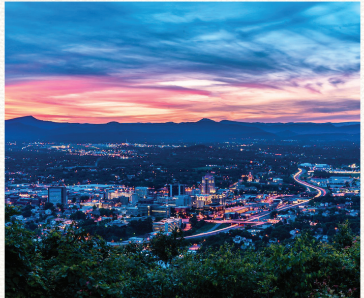
The Blue Ridge Rising Summit will be held in Roanoke.

To learn more about the work guiding the summit, you can request a printed copy of the Blue Ridge Rising Action Plan, which details steps and objectives outlined by leaders from the 29 counties that neighbor the national park. Email Kelly Fain at kfain@brpfoundation.org to receive a copy or visit BlueRidgeRising.com to read the plan online.