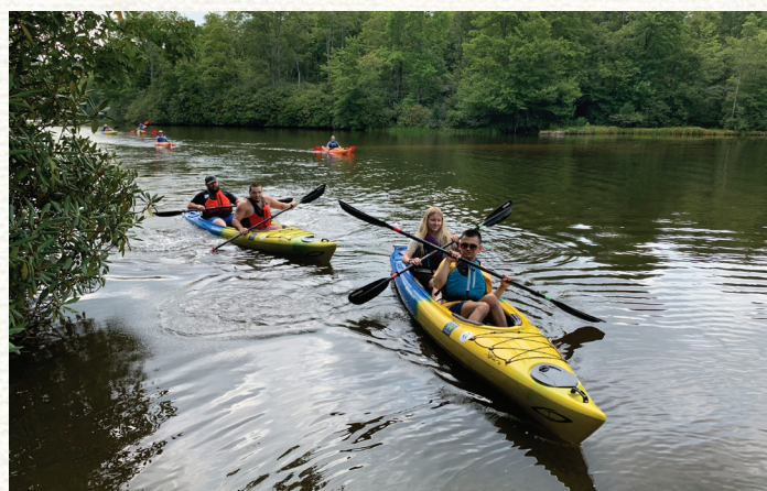
Kayakers and volunteers explore Price Lake on the Parkway.

The training and excursions were funded by a grant from the National Environmental Education Foundation (NEEF).