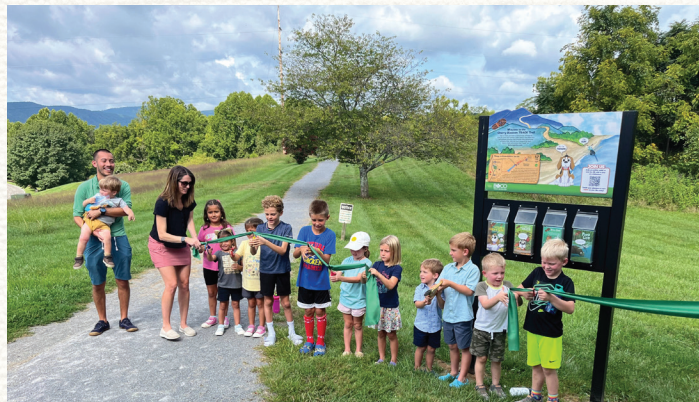
Ribbon cutting at the Cherry Blossom Trail in Daleville, Va.